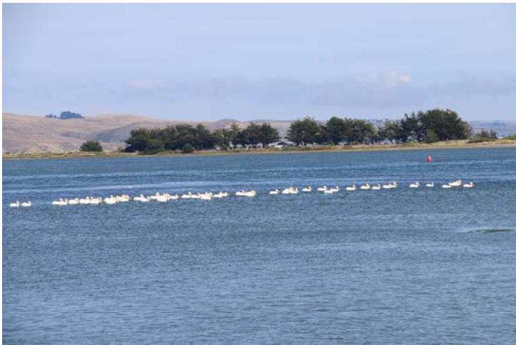
RANDOM OCEAN PICTURE

The Bodega Campout is only 4 months away. Tim and Cindy Kilkenny made reservations for the campout, but had a change of plans. They have 2 sites 37 and 38, booked from August 18 through the 22nd. These are on the water and near the showers. If you are planning on coming maybe you could help them out. The costs are $149.50 per site for the 5 days. If you are interested give them a call 707-678-3456 . As of today, the campground only has one more waterfront space available. made reservations for the campout, but had a change of plans. They have 2 sites