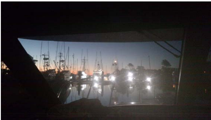
Spud Point Marina