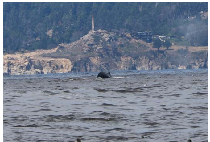
The one that got away 😊

Don't forget members of the Boat Club get 10% off all their purchases.